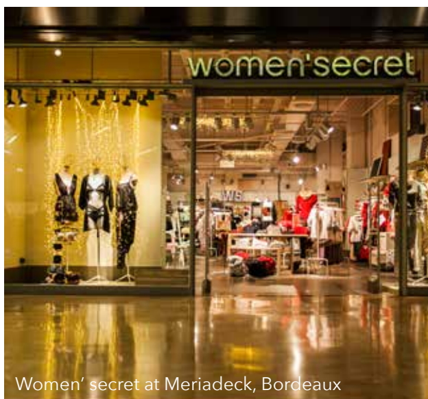
Women' secret at Meriadeck, Bordeaux