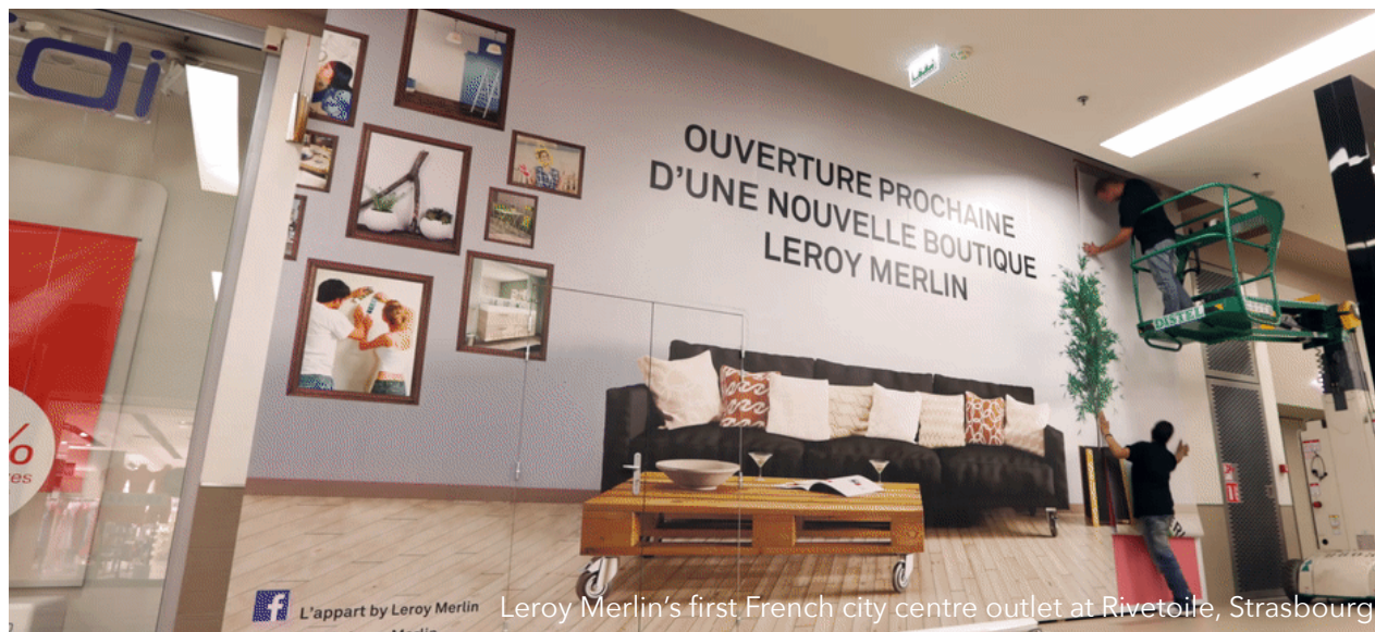
Leroy Merlin's first French city centre outlet at Rivetoile, Strasbourg