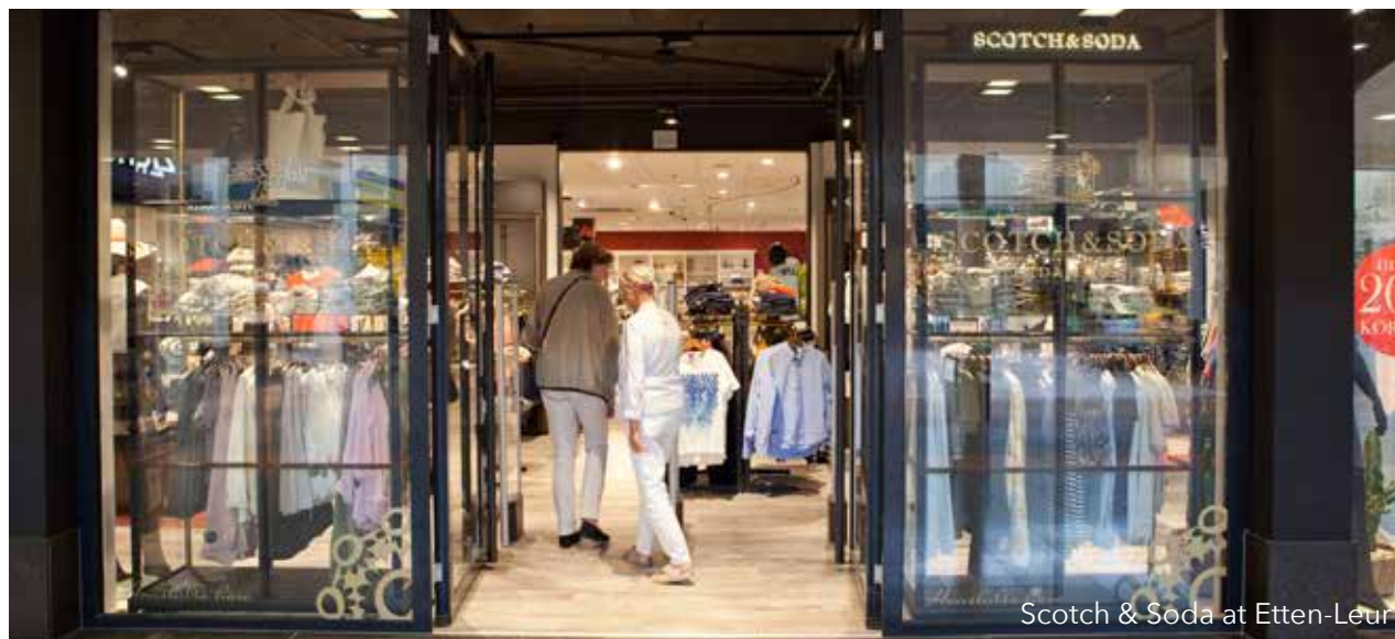
Scotch & Soda at Etten-Leur