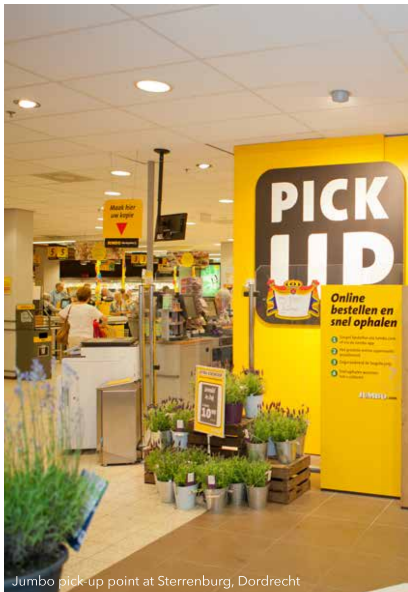
Jumbo pick-up point at Sterrenburg, Dordrecht