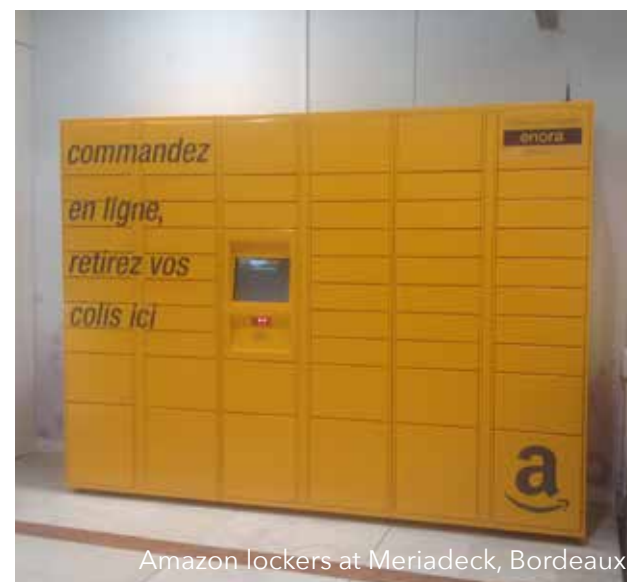
Amazon lockers at Meriadeck, Bordeaux