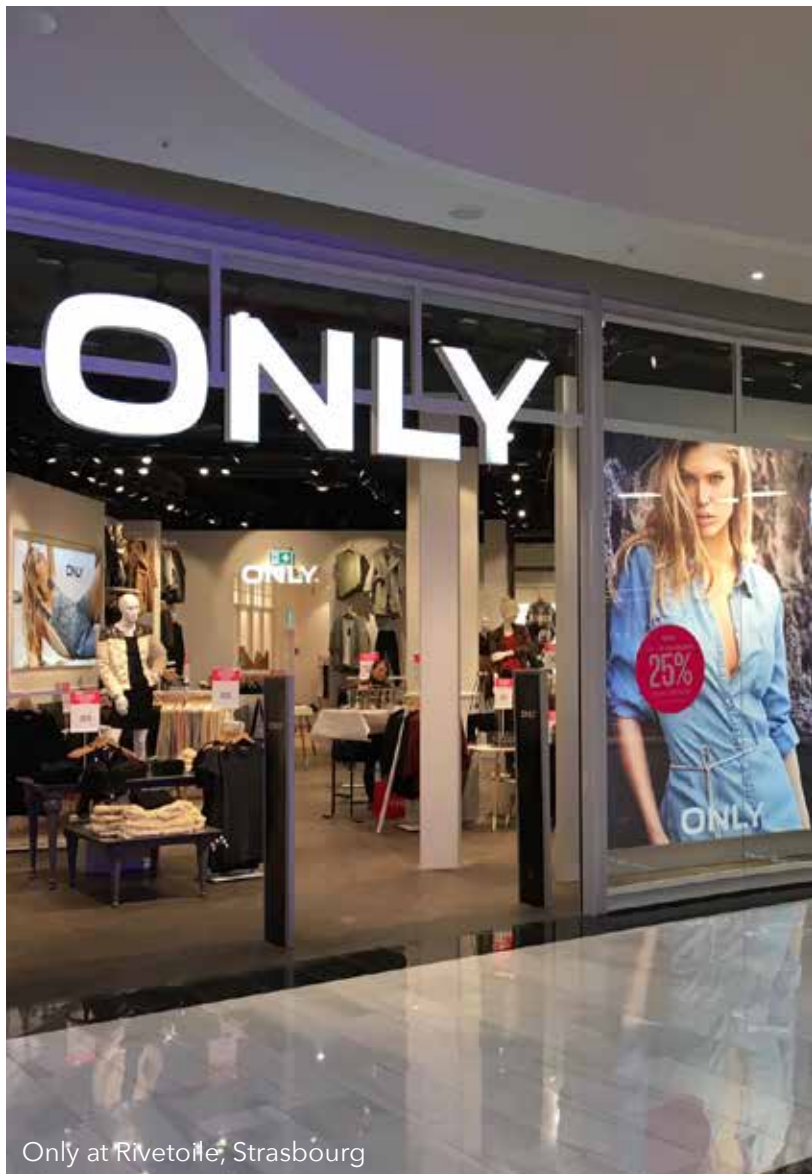
Only at Rivetoile, Strasbourg