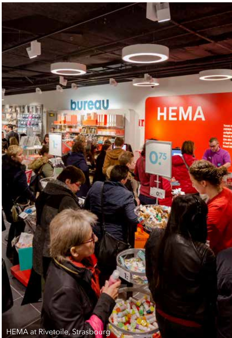
HEMA at Rivetoile, Strasbourg