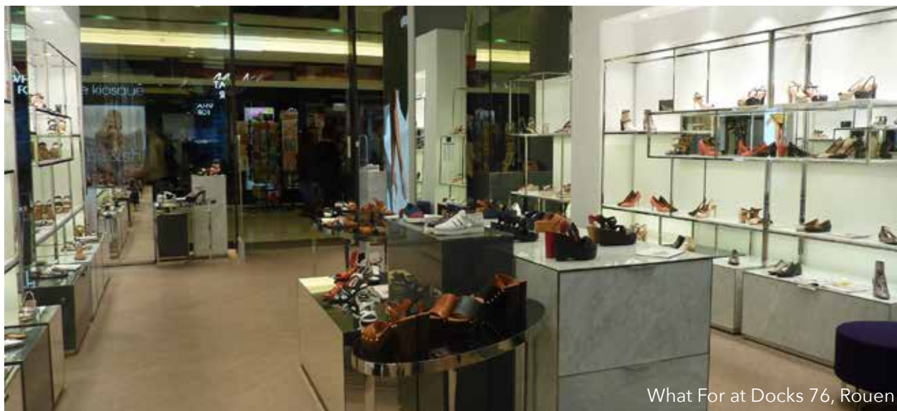
What For at Docks 76, Rouen